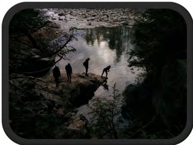
Photos from November SD48 International Activities— Exploring Lynn Canyon in North Vancouver

Host parent volunteers are welcome to join and assist. Please contact Brent if you wish to do so: 604-966-1014 Email: bgoodman.iepsd48@gmail.com